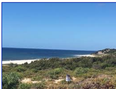
Peppermint Grove Beach