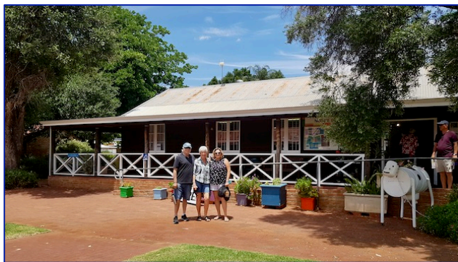
Exploring the historic Edenvale precinct.