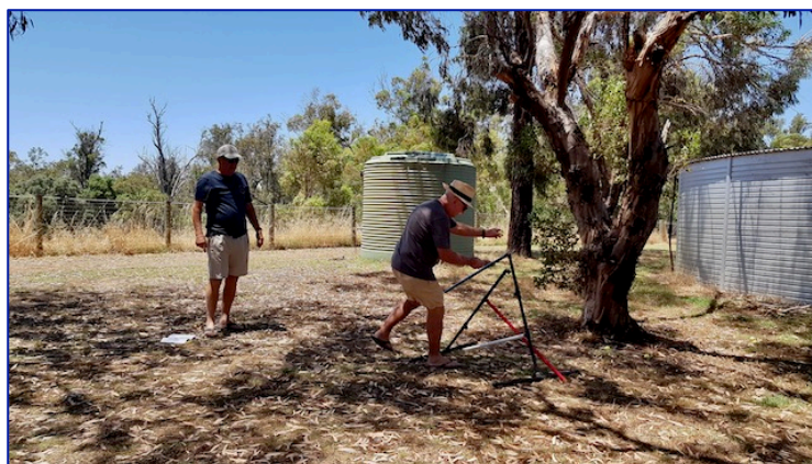
Running repairs of the apparatus.