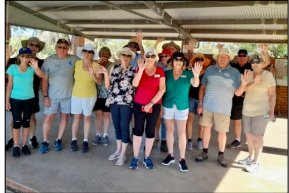
Magical Mystery Tour Walkers