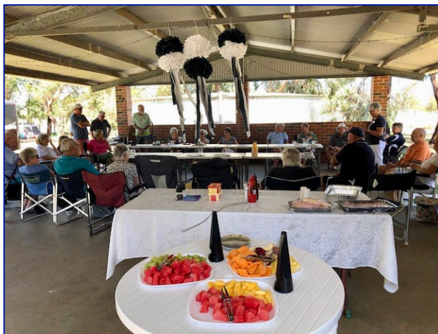
Close of another great Rally.