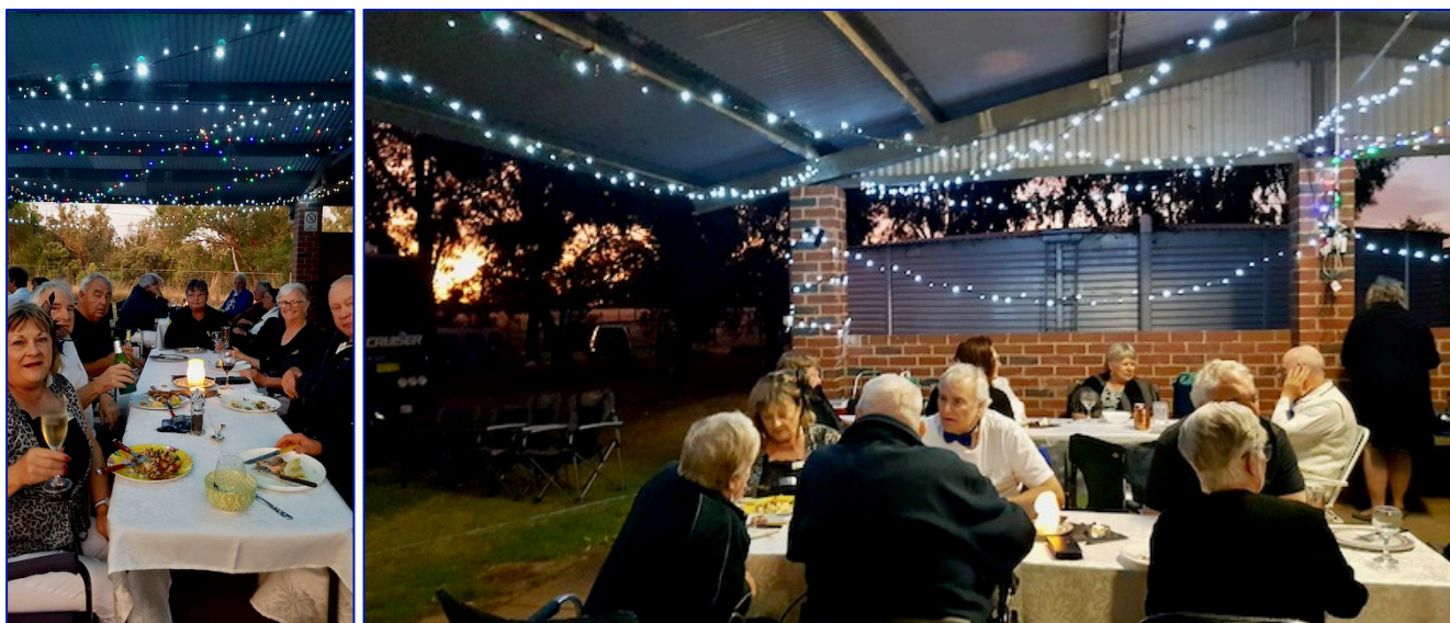
Dining under the fairy lights with a magnificent sunset in the background.

Our celebrations go into full swing a 6.00pm for Happy Hour where everyone was resplendent in their black and white attire. The yummy nibbles were devoured before sitting down under the magnificently strung fairy lights to a BBQ dinner where our Sandgroper ladies excelled themselves once again with a variety of tasty salads followed by a tantalising array of desserts. It was our last feast before our dieting promises came into force as New Year resolutions.