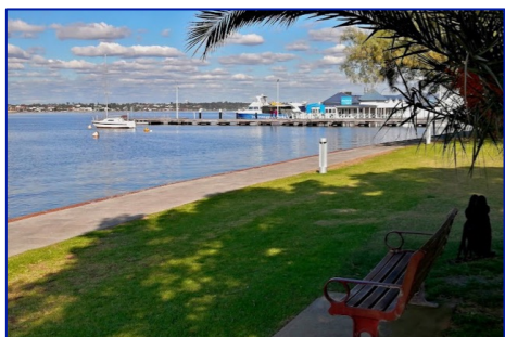
J.H. Abrahams Reserve Crawley