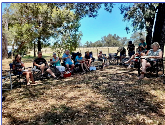
Picnicking under the shady gum trees.