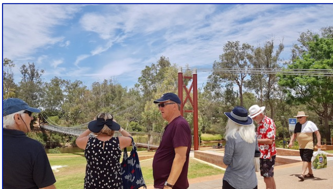
The suspension bridge in Pinjarra