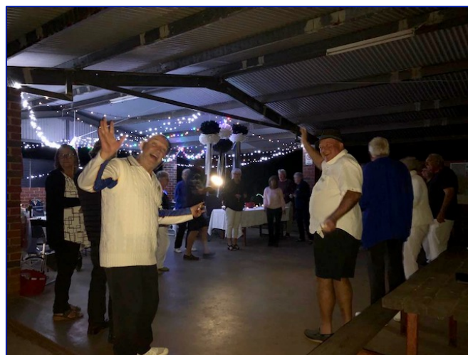
HAPPY NEW YEAR!