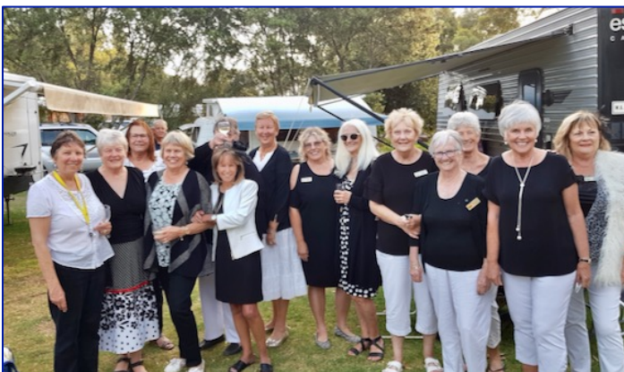
Sandgropers all resplendent in black and white to set the scene for the evening's festivities